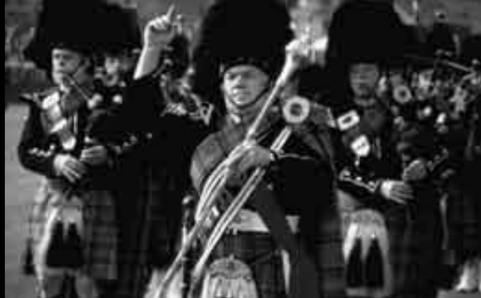
PIPERS AT HIGHLAND GAMES