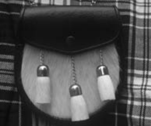
SPORRAN AND KILT