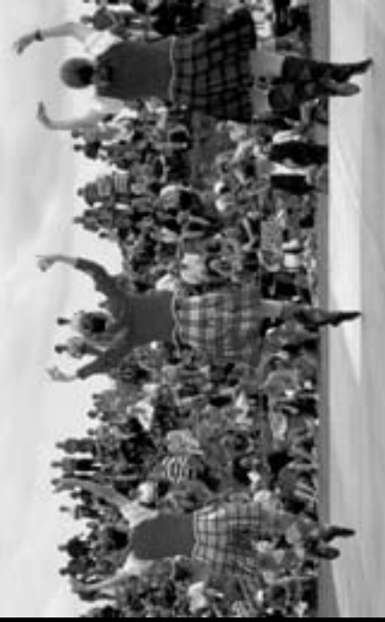
HIGHLAND GAMES DANCERS