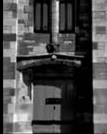
QUEEN'S CROSS CHURCH, GLASGOW