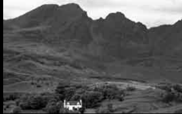
ISLE OF SKYE