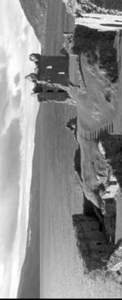
URQUHART CASTLE, LOCH NESS