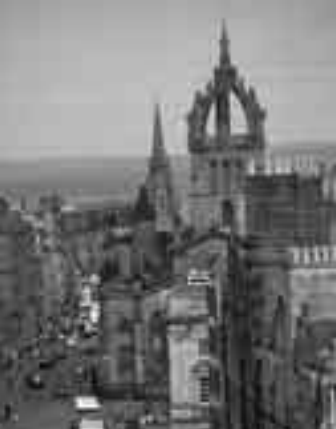
ROYAL MILE, EDINBURGH