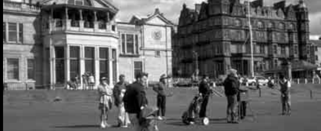
ST. ANDREWS OLD COURSE